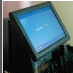
Stingray is doused to test water resistance

With nearly 30 years in the industry, Panasonic has vast experience gained from designing, engineering and supporting multiple generations of Point of Sale solutions. All reflected in the quality, durability, convenience and intelligence built into every Stingray – and giving you the power to change.