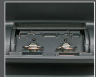
Easy-to-use thumb screws allow the end user to remove/replace modules

Stingray's LCD display, hard drive, main body, rear display (static or interactive) and 2/4 line customer order display are user-removable and replaceable through the use of conveniently placed thumb screws. It's fast, easy, and cost effective – simply place a sales order for a new module or stock the inventory on your own shelf to virtually eliminate downtime. No service contract required – pay only for parts.